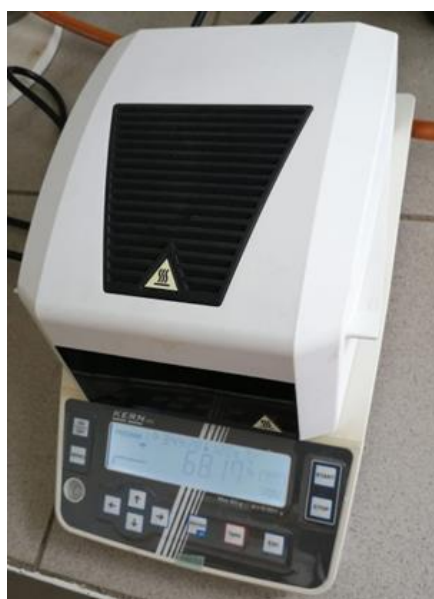
Figure 1. Thermobalance

The first phase of the working process consisted in the homogenization of the samples; then, the thermobalance in the image below was used to determine the moisture.