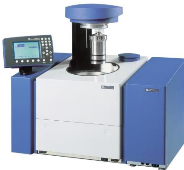
Figure 2. Calorimeter C5000, IKA

Finally, the calorimeter (C5000, IKA, Germany) in the figure below was used to indicate the energy values, the upper calorific value HHV and the lower calorific value LHV for the raw material, by the combustion method, the calorimetry and the adiabatic method, respectively (Zaharioiu et al., 2020).