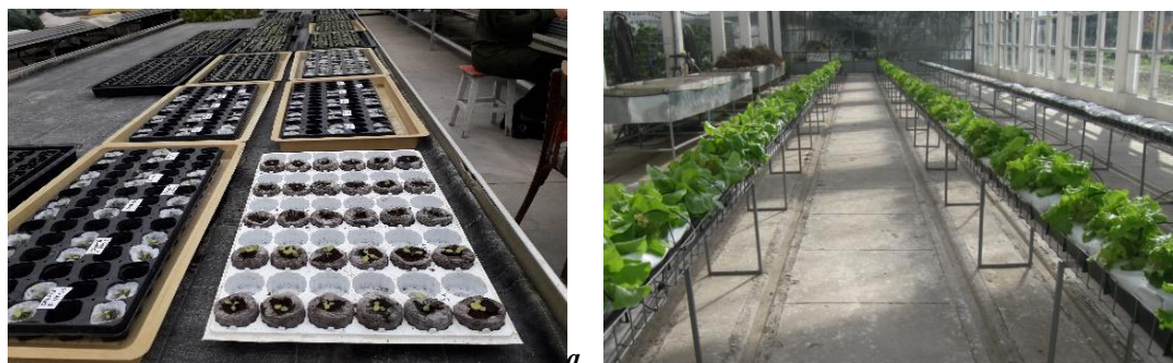
Figure 2. Jiffy pots (a) and mattresses with perlite (b)