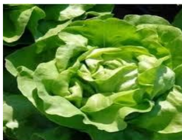
Figure 1. „Alanis” lettuce

The seedling has been produced in Jiffy pots with peat. Mattresses filled with perlite in two variants of perlite (2 mm and 4 mm diameter) have been the culture substrate.