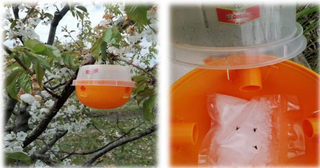
Figure 2. Rhagoletis cerasi L. captured with Decis trap at the flight start and maximum flight curve