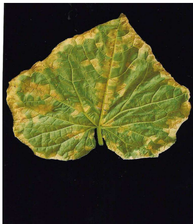
Figure 2. Pseudoperonospora cubensis – attack on the leaf