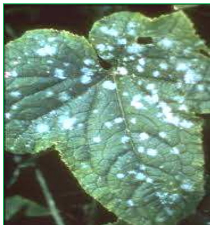
Figure 1. Sphaerotheca fuliginea – attack on the leaf