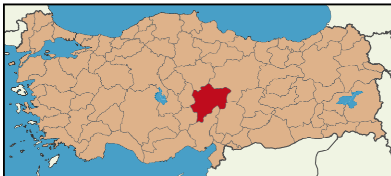
Figure 1. Kayseri province in Turkey

This study was carried out in the vineyard areas determined and representing in Gesi region of Kayseri province in 2018 (Figure 1). In the scope of study, vineyards were examined in 2 different locations representing Gesi region.