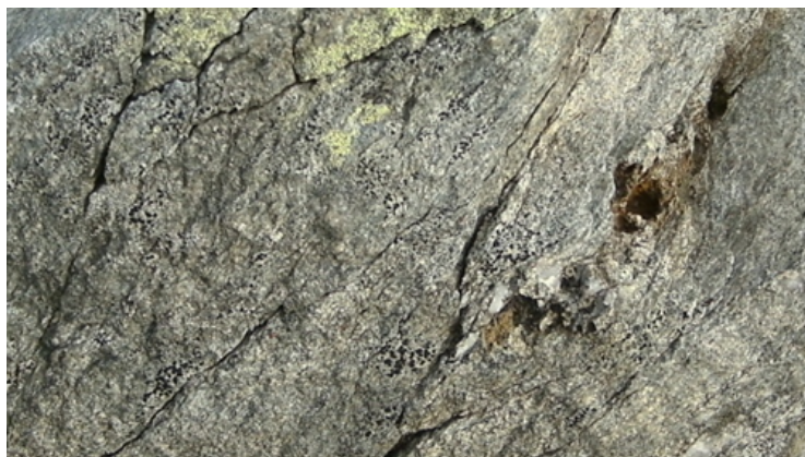
Figure 2. Micro-cracks (secondary porosity)