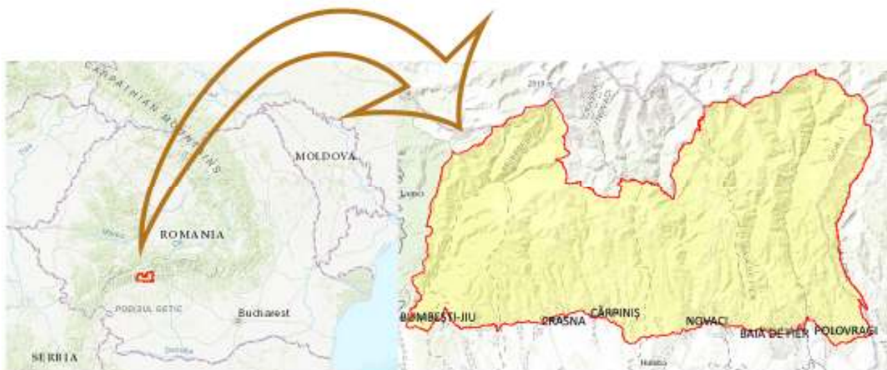
Figure 1. General map of the area (processed after http://natura2000.eea.europa.eu/Natura2000/SDF.aspx?site=ROSCI0128 )

The site Natura 2000 ROSCI0128 Nordul Gorjului de Est, with a surface of 49,160 hectares, was designated in 2007, natural area protected by community interest. In this site there were already eight areas with the status of protected areas, covering a surface of 755 hectares. The site is located in the Meridional Carpathians, over the Southern part of Parâng Mountains, and in the Western part of Căpățâni Mountains (Fig.1); it is situated in the alpine (88.97 %) and the continental biogeographic regions (11.03 %). The coordinates of the area are N 45° 15' 17" lat. and E 23° 37' 22" long. and its altitude ranges between 348 m and 2.314 m a.s.l. The community importance of this site consists of 25 habitats, 4 species of plants, 16 species of vertebrates and 2 species of invertebrates, meaning the L. cervus coleopteran and the Callimorpha quadripunctaria lepidopteran.